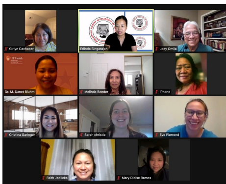
Some FAPCOR Nayon Leaders at Training