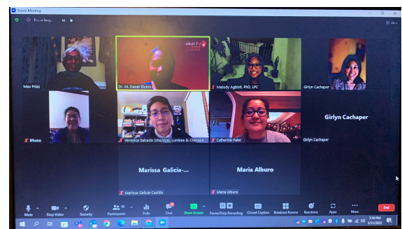
VA FAPCOR Stakeholder Advisory Council Meeting